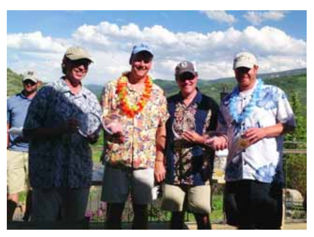
Congratulations to REPEAT WINNERS 1st and Main Investment Advisors, the 2013 tournament champions!